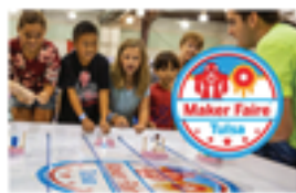
August 24, 2019 Tulsa