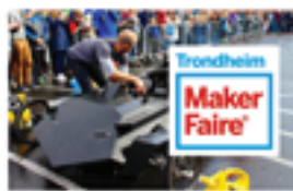
August 30 & 31, 2019 Trondheim